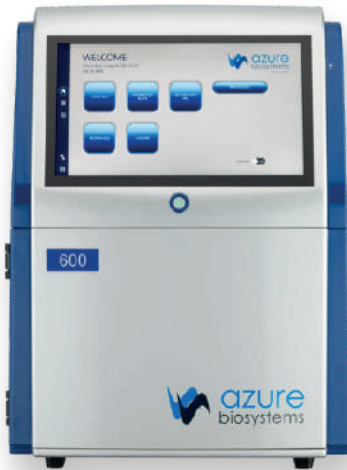
Azure Imaging Systems Workhorse systems for every lab