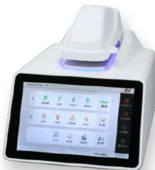
NanoReady Touch Micro volume (UV-Vis)