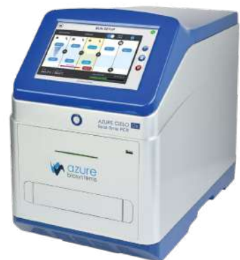
AzureCielo Real-Time PCR