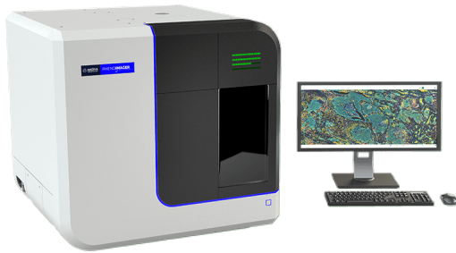
Phenolmager® (formerly Phenoptics) Spatial Discoveries at Scale