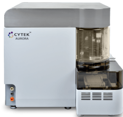
Cytex® Aurora A prodigy that's taking flow cytometry to the next level of performance and flexibility.